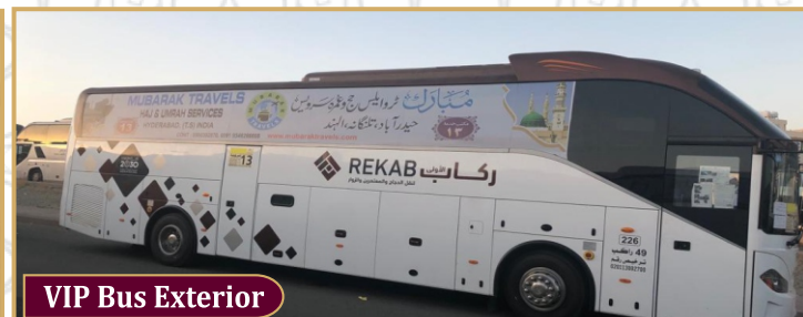
VIP Bus Exterior