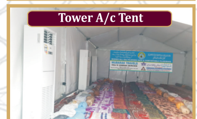
Tower A/c Tent