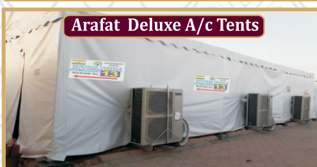
Arafat Deluxe A/c Tents