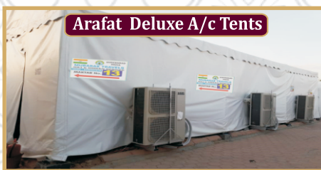
Arafat Deluxe A/c Tents