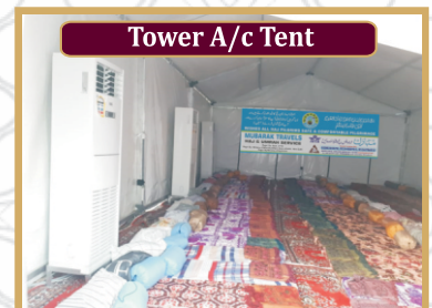
Tower A/c Tent