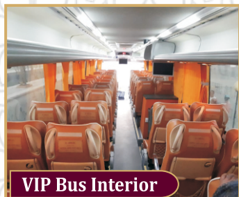
VIP Bus Interior