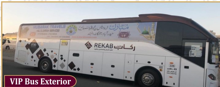
VIP Bus Exterior