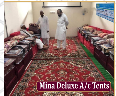
Mina Deluxe A/c Tents